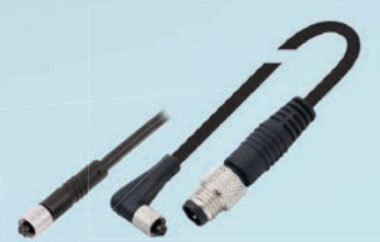
M5 SENSOR AND ACTUATOR CABLES

Balluff specializes in providing connectivity solutions for harsh environments in the industrial automation space. Balluff's high durability cable (HDC) portfolio includes high temperature cables, weld spatter resistant cables, stainless steel braided cables and much more. Balluff's portfolio continues its expansion to support multiple industries and applications such as packaging, food and beverage, automotive, life sciences, wood, metalworking and more.