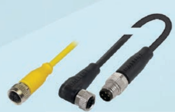
M12 SENSOR AND POWER CABLES