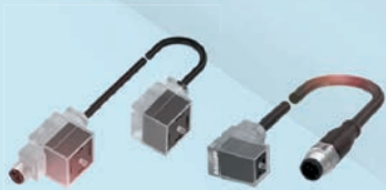
DIN A, DIN B, DIN C, C SENSOR AND ACTUATOR CABLES