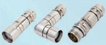
M23 FIELD ATTACHABLES