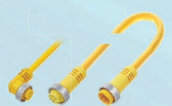
1" AND 1 1/8" MINI SIZE CABLES