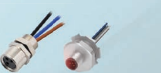
M8 AND M12 RECEPTACLES