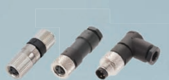
M8 FIELD ATTACHABLES