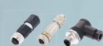
M12 FIELD ATTACHABLES