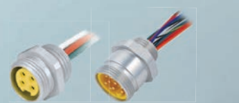
7/8", 1", 1 1/8" MINI RECEPTACLES