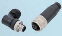
1/2" AC, 7/8" FIELD ATTACHABLES