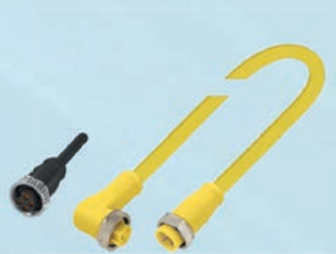
7/8" MINI SIZE CABLES