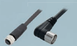
M12, M16, M23 HOME RUN CABLES