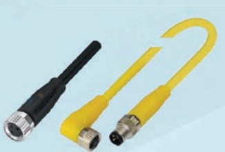
M8 SENSOR AND ACTUATOR CABLES