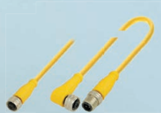
1/2" AC SENSOR AND ACTUATOR CABLES